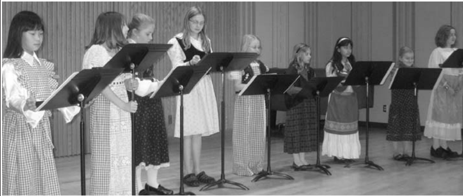
Spotlights presents "Sound of Music"

Saturday, January 19, 2008 from 11 AM to 2 PM