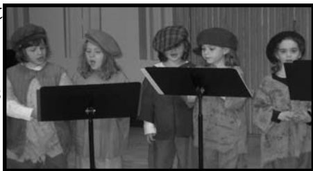
Spotlights singing selections from OLIVER