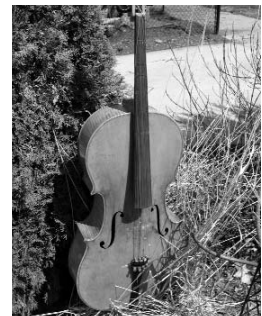
Artist Heidi Garske's cello "before" she is transforming it into art.. Visit wausauconservatory.org to see "after" photos.

They will be auctioned off at Una Notte Bella.